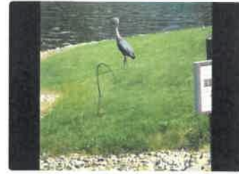
Heron by Pond