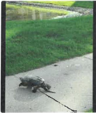
Mr. Snapping Turtle